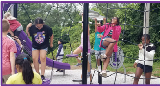
Students enjoying the new playground